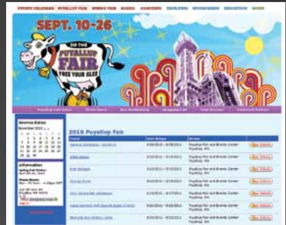
Branding Opportunities with Ticketing Site.