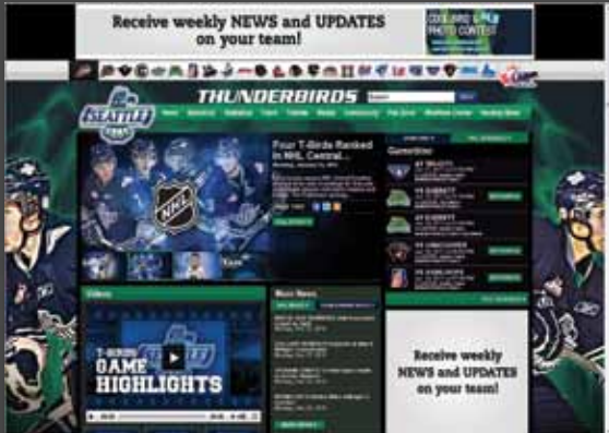
Branding Opportunities with Ticketing Site.