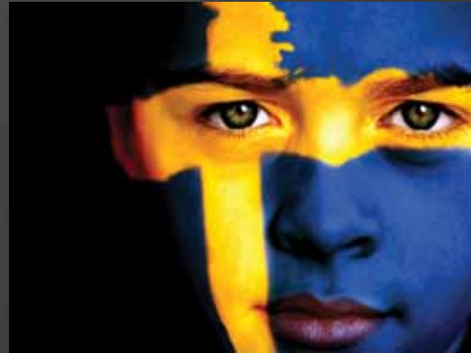
Give your patrons a reason to be a fan.